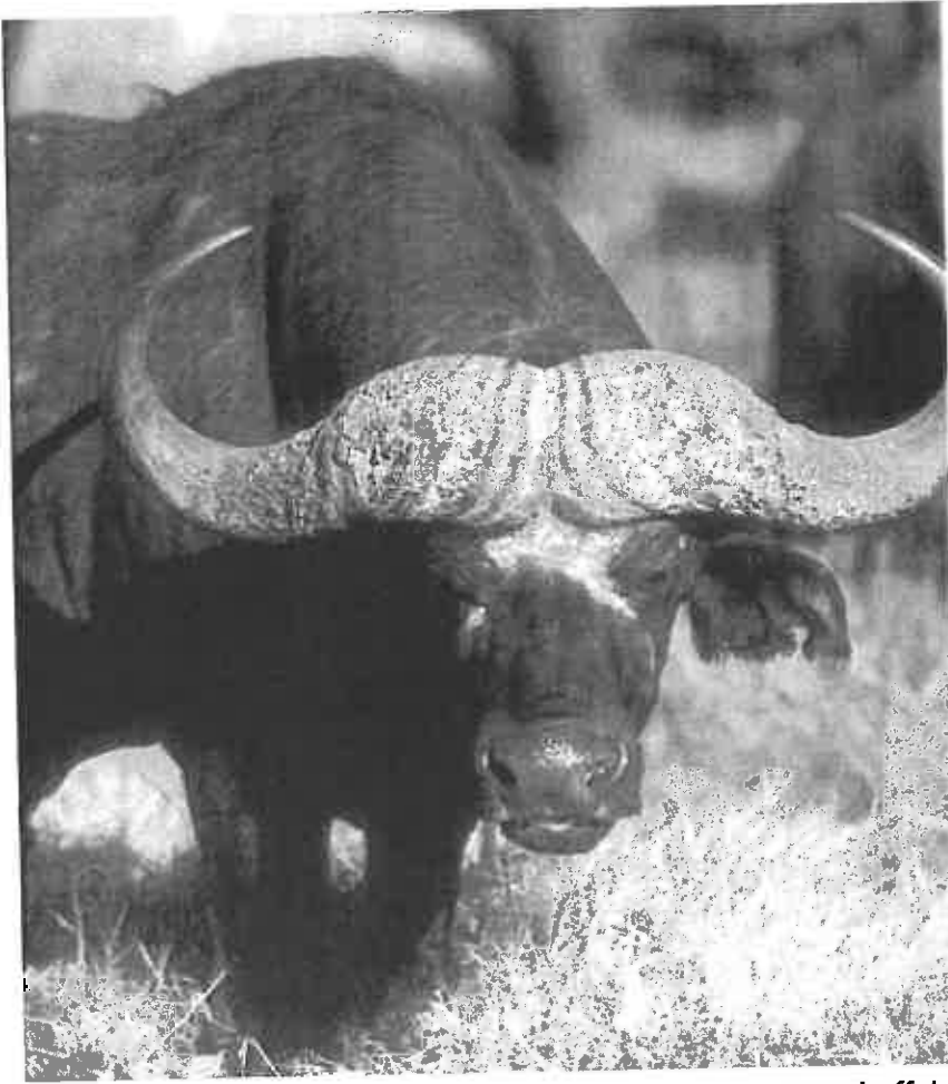
Cape buffalo.